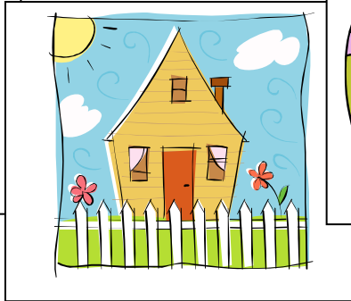
UTILITIES AND PROPERTY TAXES